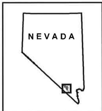
EXHIBIT A Forest Order 04-17-17-05 Fire Restriction

Humboldt-Toiyabe National Forest Spring Mountains National Recreation Area